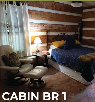
CABIN BR 1